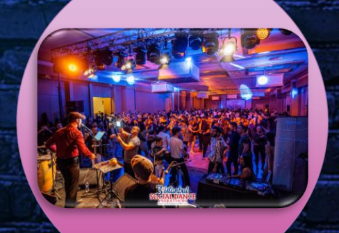
5 Days Parties until 7 am (3 Dance Halls SBK)