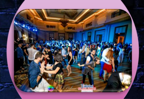
Salsa, Bachata, Kizomba Dancers from +72 Countries