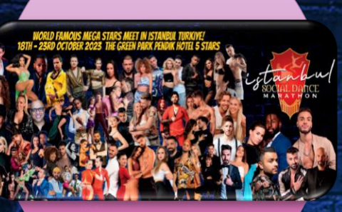
World's Famous and Best Artists, Instructors & DJs