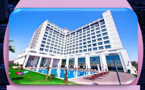
All Under The One Roof : The Green Park Pendik Hotel