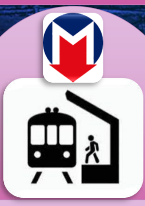
Close Metro station (2 minutes to venue by walking)