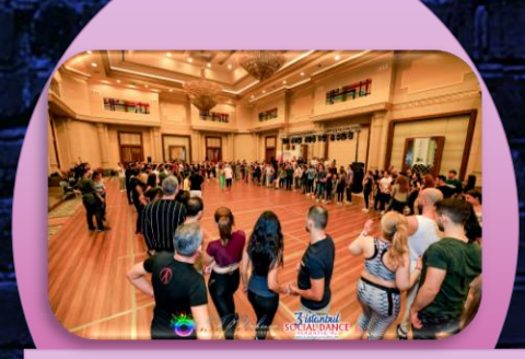
8 Workshops Rooms (All Level, Intermediate, Advanced, Master)