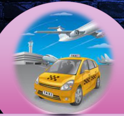
Sabiha Gökcen Airport 10 minutes to the Venue (7 km)