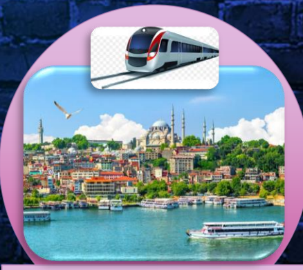
Easy Transportation to the City Center with only one line