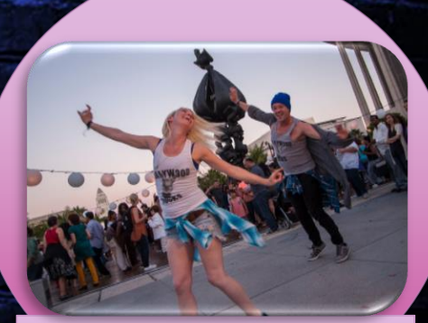
Sea View Outdoor Afternoon Parties