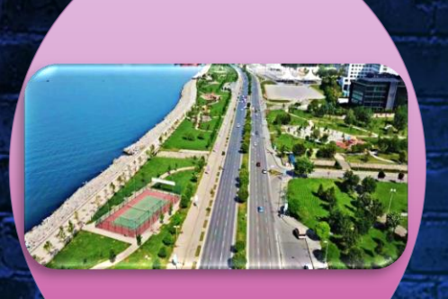
Coastline in front of the Venue with 8 km walking area