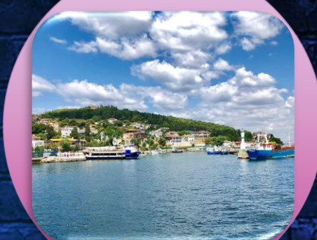
Panoramic view of the Marmara Sea and the Prince Islands