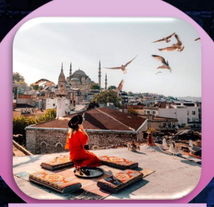
Gorgeous & Historical City of Turkiye: Istanbul!