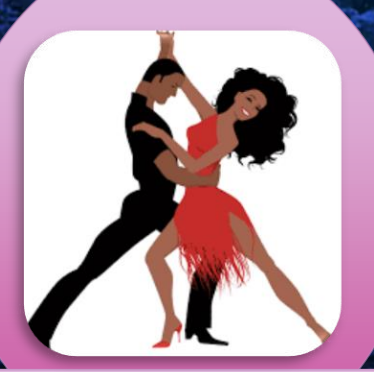
Excellent Shows (Only Thursday)