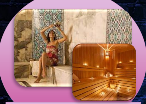
Sauna, Turkish Bath, Indoor & Outdoor Pools, Fitness (free for hotel guests)