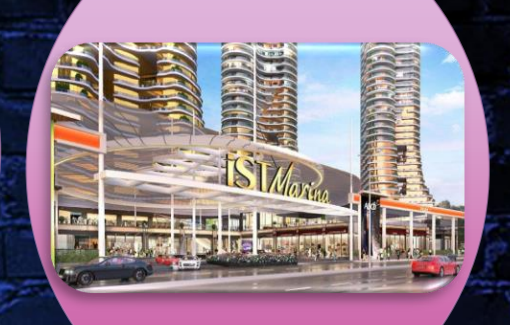
Big shopping malls close to the Venue (4 km)