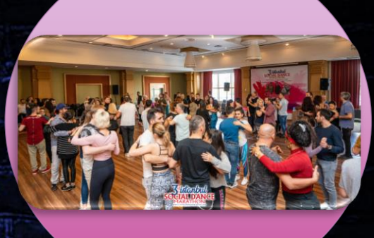
150 hours Workshops (4 Days) & 30 hours Master Classes (3 Days)