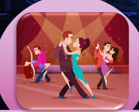
Competition on 8 categories with total Prize 4.500 € (Only Thursday)